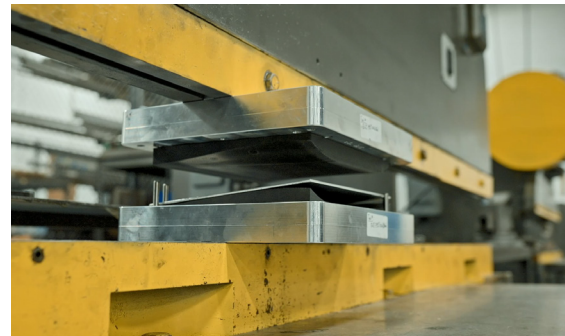
A sheet metal part is about to be formed with the 3D printed dies.